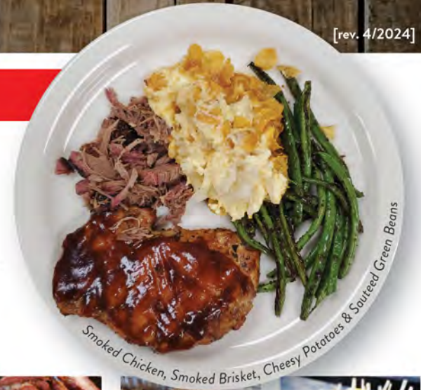
Smoked Chicken, Smoked Brisket, Cheesy Potatoes & Sauteed Green Beans